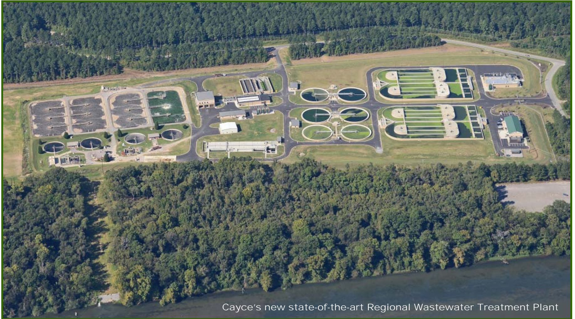
Cayce's new state-of-the-art Regional Wastewater Treatment Plant